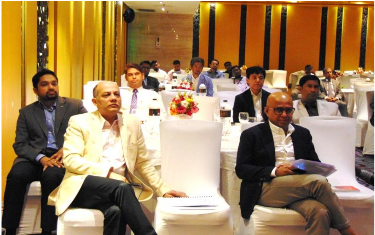
Photo: A view from the 14 th AGM of JBCCI, during the AGM discussion going on.