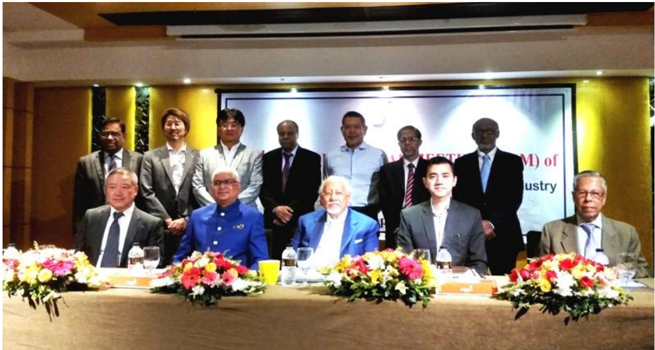
Photo: the Group Photo of Board of Directors, Past Presidents and Adviser of JBCCI