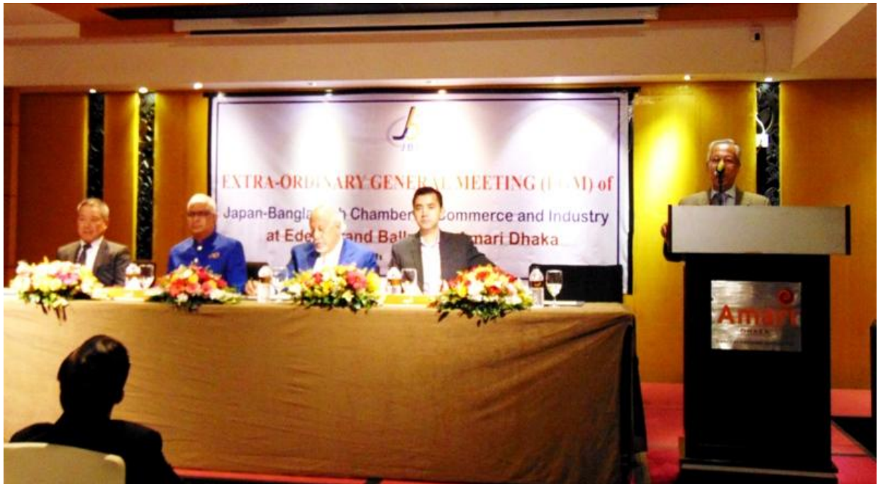
Photo: A view from the EGM of JBCCI held at Amari Hotel. Directors of JBCCI explaining about the issues of EGM to the invited guests of JBCCI.

An Extra – ordinary General Meeting (EGM) and the 14th Annual General Meeting (AGM) of JBCCI were held at Amari Dhaka which successfully ended with a lunch.